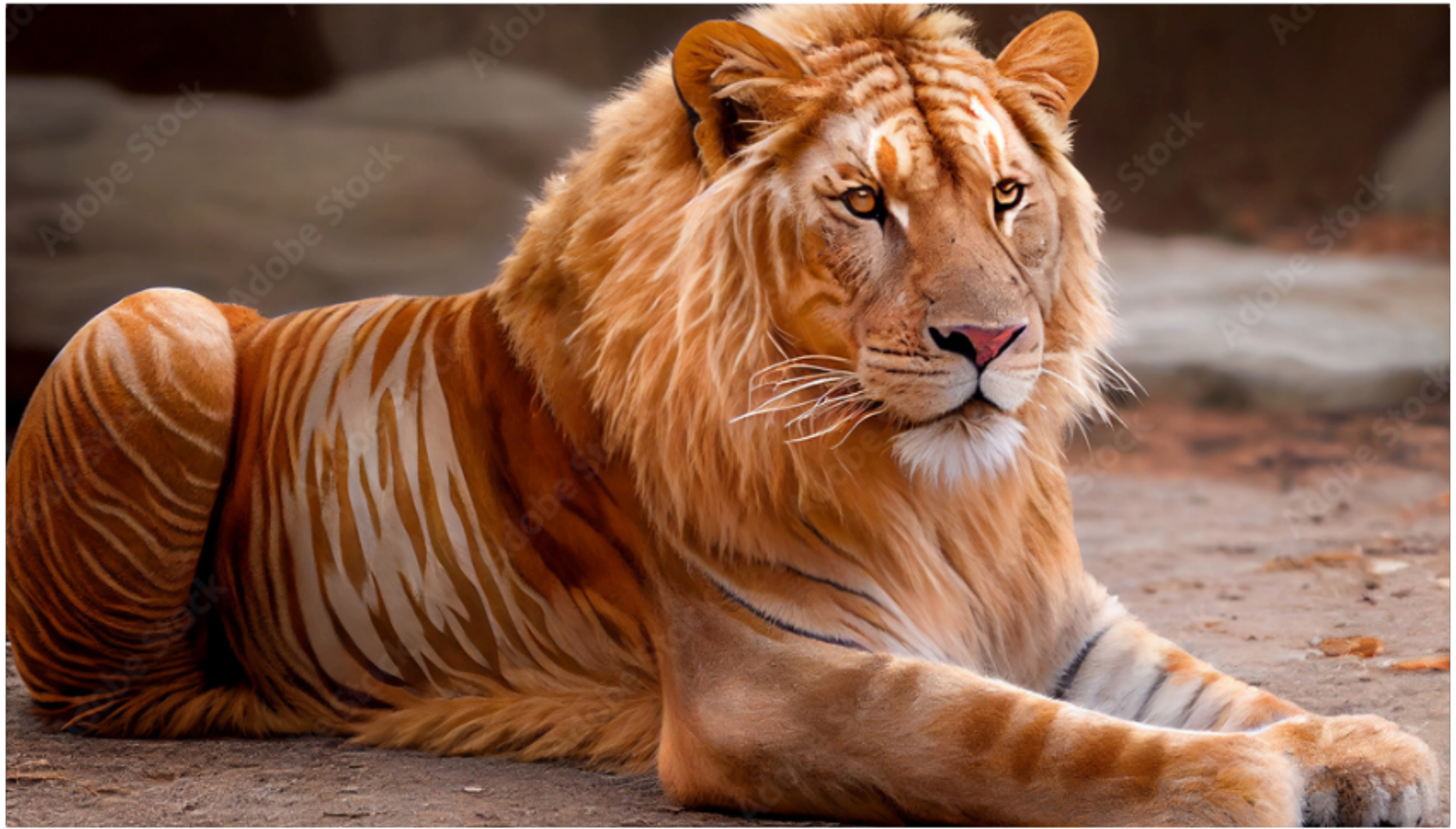
The Sacred Liger