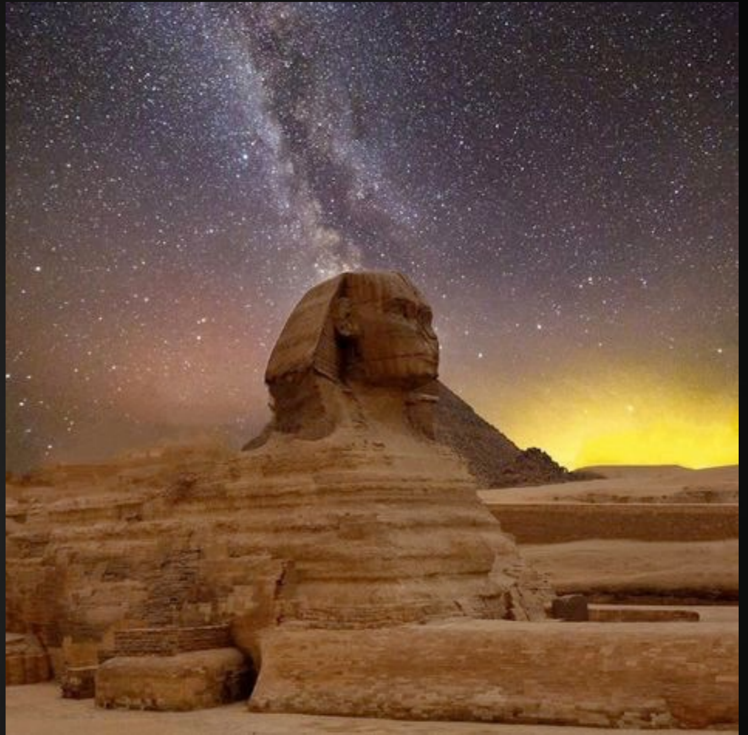
The Great Sphinx of Giza and The Constellation of Leo