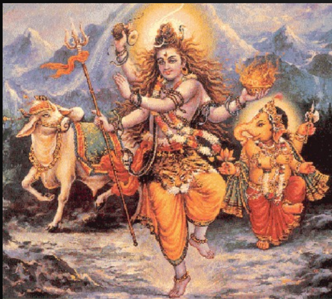
Ganesha The Quick-Acting Savior

T HE SACRED LIGER Shabbat Day, August 23, Year 2003 (Please see: "El Camino Iniciático Esotérico Capítulo XII: 1 - - III - El León-Tigre Sagrado (The Sacred Liger) [The Initiatic Esoteric Path Chapter XII: 1 - III - The Sacred Lion-Tiger (The Sacred Liger)]" )